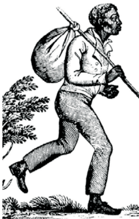
1849 Underground Railroad